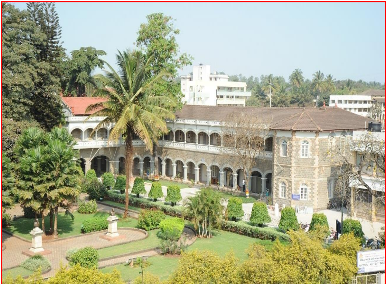
KLE Society's Lingaraj College, Belagavi (East Wing)